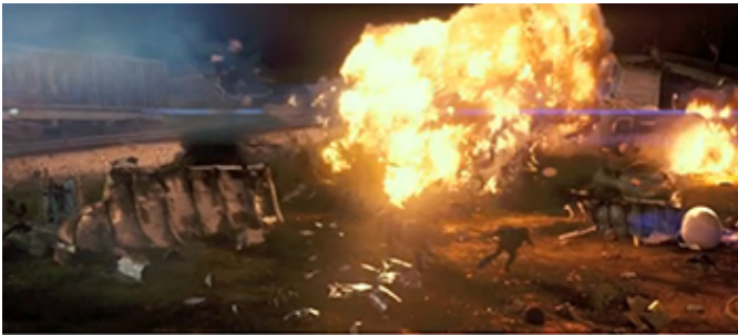
The wavelet turbulence for fluid simulation was used for special effects in Super 8 (Paramount Pictures, 2011) among 26 films to date.

"We were very surprised," Kim said of the invention's quick ascension as a go-to graphics tool. "Usually you present a paper to 100 or 200 peers, maybe release the source code into the public domain, there is interest for a little bit, then it dissipates. In this case, there was quite a bit of interest from beginning. And because the source code was distributed for free, it turns out a lot of people were downloading and integrating it into their own software. Now it's used in places all over the world."